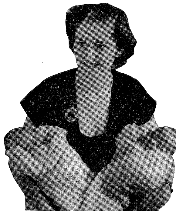
Plate 11.2. Margaret Thatcher aged 28, with her twins, 1954. Recently called to the Bar, she defended the rights of the working mother in Onward , a Conservative party monthly magazine, April 1954; 'it all depends on the woman'. While domesticity will suit some women, 'if she has a pronounced bent in some other direction in which she has already achieved some measure of success then I am sure that it is essential both for her own satisfaction and for the happiness of her family that she should use all her talents to the full. With a little forethought she will find that most things are possible.'

One can generalise such figures by thinking of an 'index of gender segregation' – simply the percentage of women in an occupation that would need to